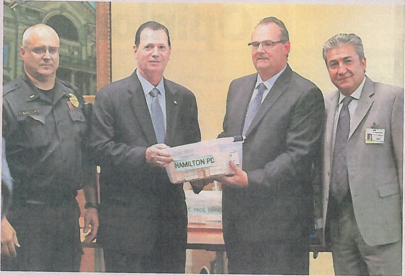
Hamilton officials receive a second shipment of the heroin antidote naloxone from the Mercer County Prosecutor's Office on Thursday.